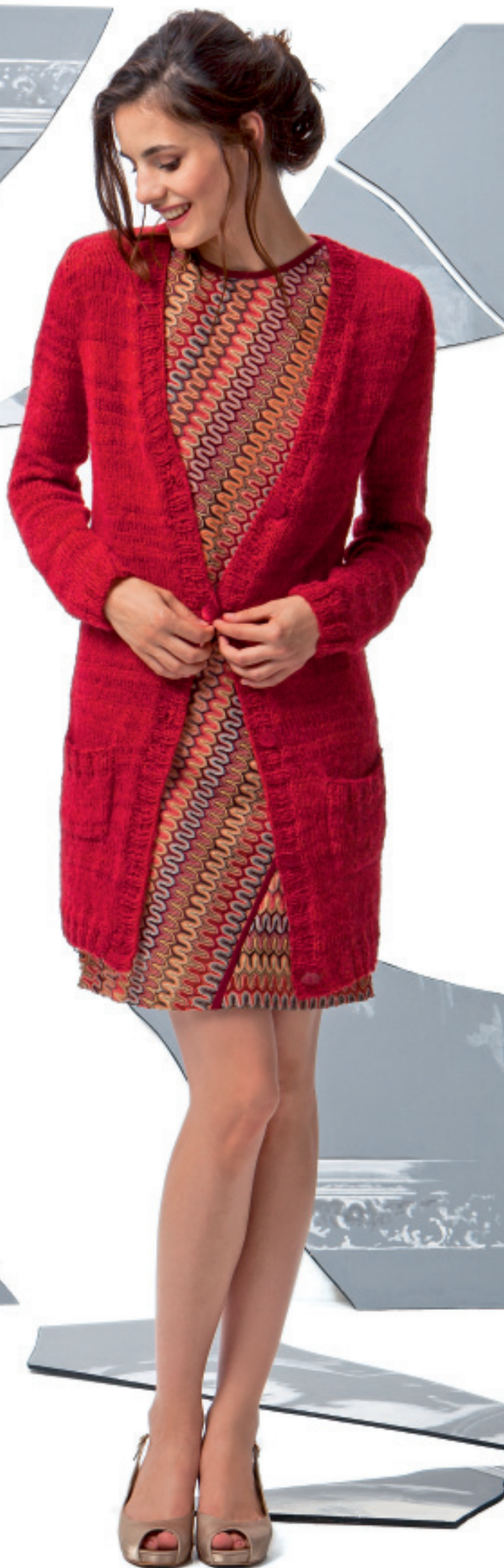
48 ella / alpaca superlight