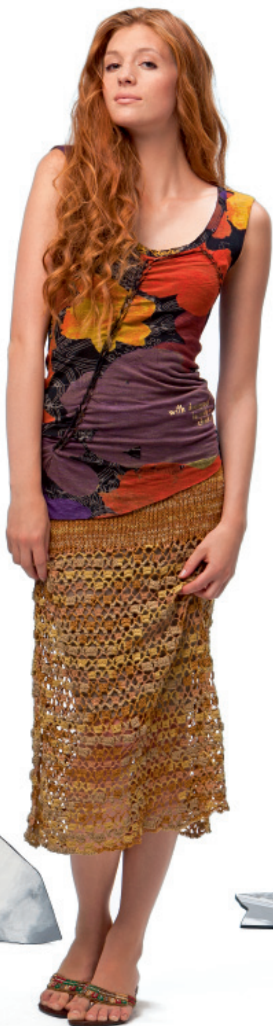
9 ella / baby cotton