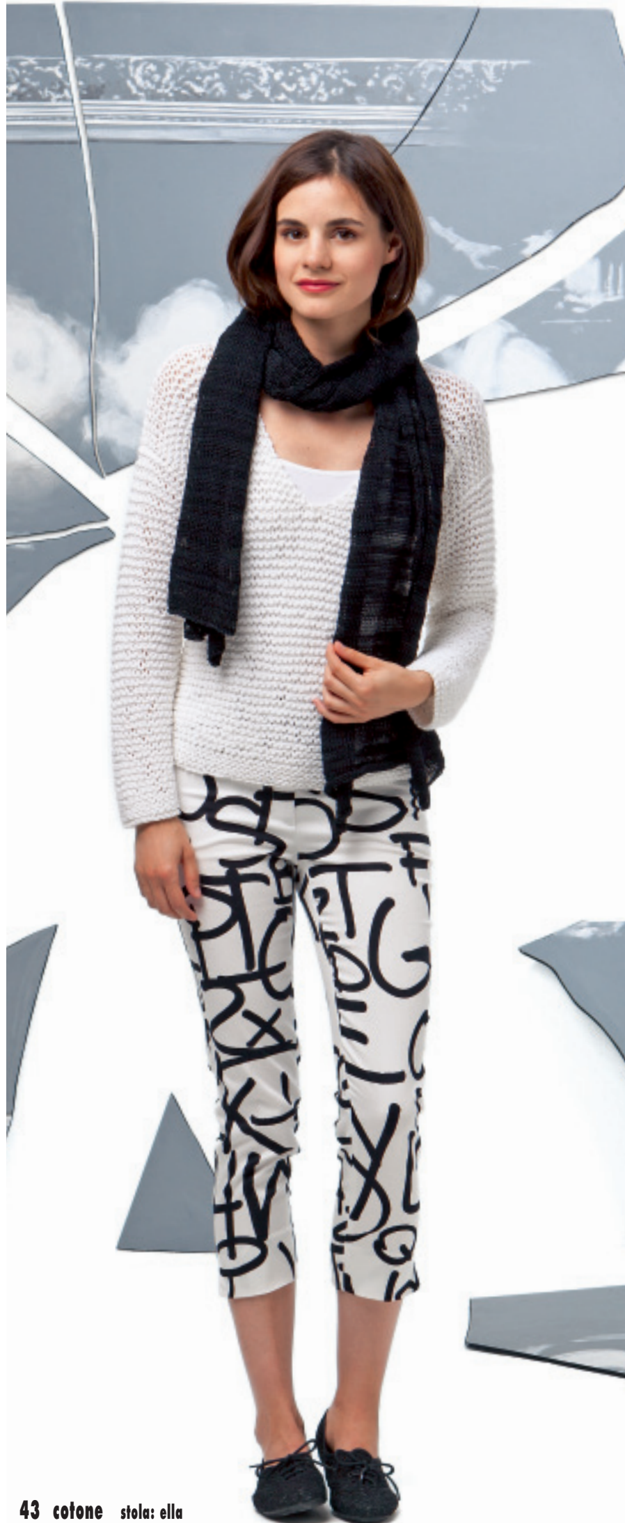
43 cotone stola: ella